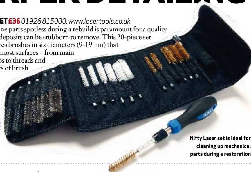
Nifty Laser set is ideal for cleaning up mechanical parts during a restoration

Getting all of your engine parts spotless during a rebuild is paramount for a quality job, but carbon and oil deposits can be stubborn to remove. This 20-piece set from Laser Tools features brushes in six diameters (9-19mm) that can be used to clean up most surfaces – from main and big-end bearing caps to threads and valve stems. Three types of brush are included for each diameter – nylon, brass and stainless steel – making the set suitable for use on both cast iron and softer aluminium, while a 6in extension and quick-change shank make it easier to reach awkward areas.